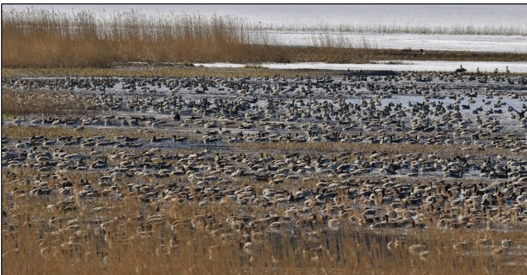
Geese are usually together in large flocks in the non-breeding season, here Pink-footed Geese ( Anser brachyrhynchus ) in Norway

An up-to-date evaluation of the effectiveness of the different measures is beyond the scope of this report (but see the review evaluating scientific papers and reports at the goose-agriculture interface up to February 2014; Fox et al. 2017). We suggest that this should be a prioritised task when implementing common management tools in European goose management in the future. Several studies are ongoing in the Range States with results relevant for coordinated actions in the future.