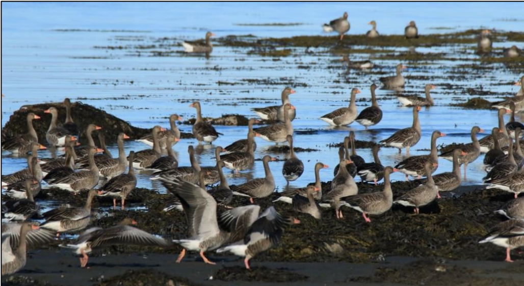
Roosting Greylag Geese (Anser anser)