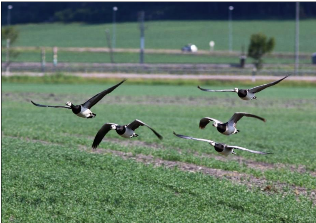
Barnacle Geese have in recent years established temperate breeding colonies in several Range States

http://www.gesetze-rechtsprechung.sh.juris.de/jportal/?quelle=jlink&query=JagdZV+SH&psml=bsshoprod.psml&max=true&aiz=true