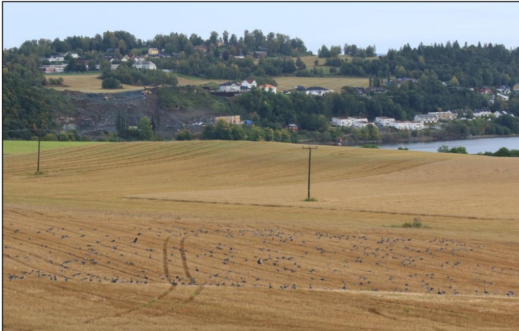
Geese foraging on spilt grain on harvested cereal fields do not cause any damages for the farmers