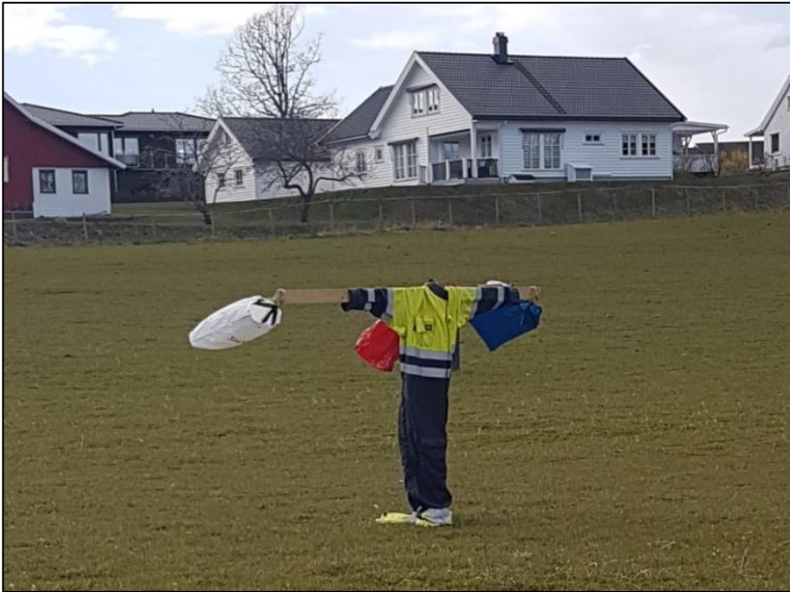
“Scare crow” in southern part of Norway aiming to keep Barnacle Geese and Greylag Geese away from the cultivated fields